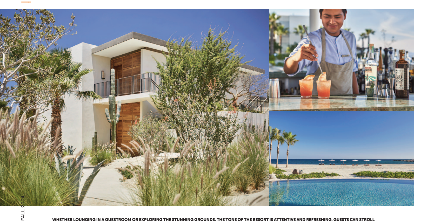
WHETHER LOUNGING IN A GUESTROOM OR EXPLORING THE STUNNING GROUNDS, THE TONE OF THE RESORT IS ATTENTIVE AND REFRESHING. GUESTS CAN STROLL THE OPEN-AIR PROPERTY AND VISIT MARINA VILLAGE, WHICH FEATURES BOUTIQUES, DINING OPTIONS, OUTDOOR LOUNGES AND WATERFRONT SPACES.